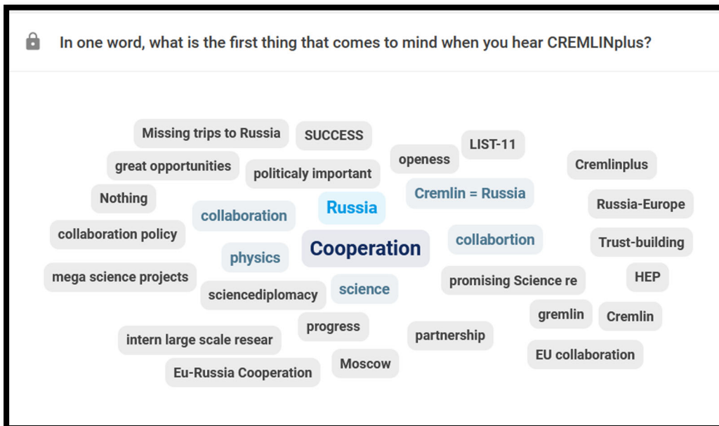
Poll results: Figure 2 “In one word, what is the first thing that comes to mind when you hear CREMLINplus?”

Altogether, the mixture of informative and insightful presentations, exchange formats such as Q&As and discussions as well as live polls contributed to an engaging, lively and successful digital event. Nevertheless, the CREMLINplus management and the whole project community hope to be able to conduct the next annual meeting as an on-site, live event.